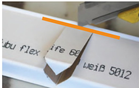
3 cut in line under the soft lip