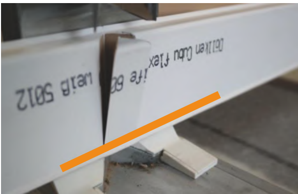
2 only cut the wooden core - only to the soft lip