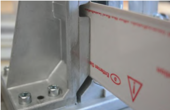
1 turn over the profile on the head - put it straight on the trestle - lock the clamping device - cut very carefully

notching of dull angles (e.g. 135° corners)