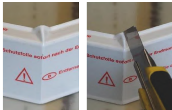
5 install the Cubu flex life around the corner