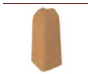
External corners 90°