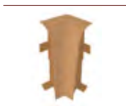
Internal corners 90°

Accessories (1 sales unit = 10 pieces, available in 8 colours)