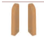
End caps left/right